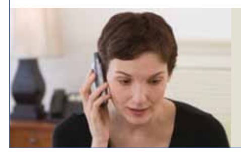
If you think it's a scam Don't be afraid to say no. Just hang up the phone, delete the e-mail or walk away.